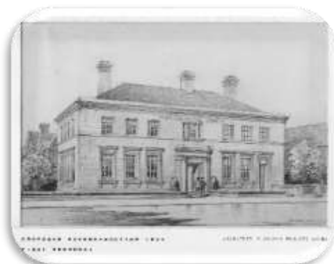
Deacon's Bank (Royal Bank of Scotland), Conway Rd