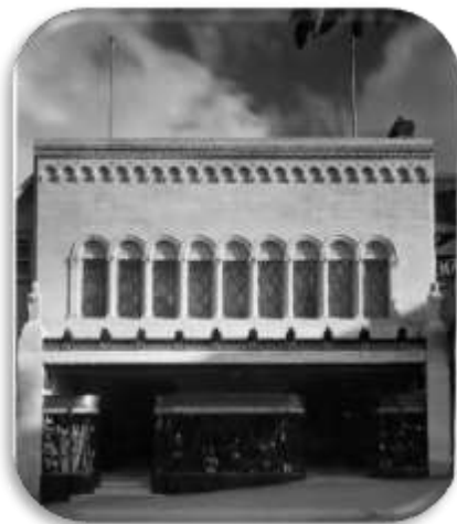
Colwyn House, (Woods) Station Rd