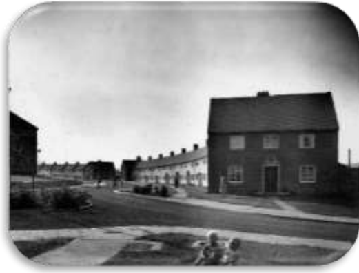
Bryn Eglwys, Rhos on Sea

Find further pictures, and building information here: Sidney Colwyn Foulkes Archives - Colwyn Bay Heritage