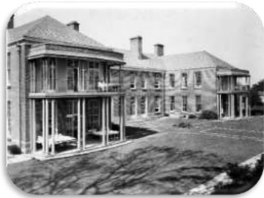
Colwyn Bay Hospital