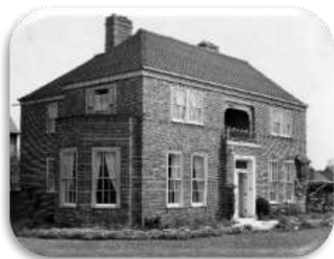
Wren's Nest Lansdowne Rd